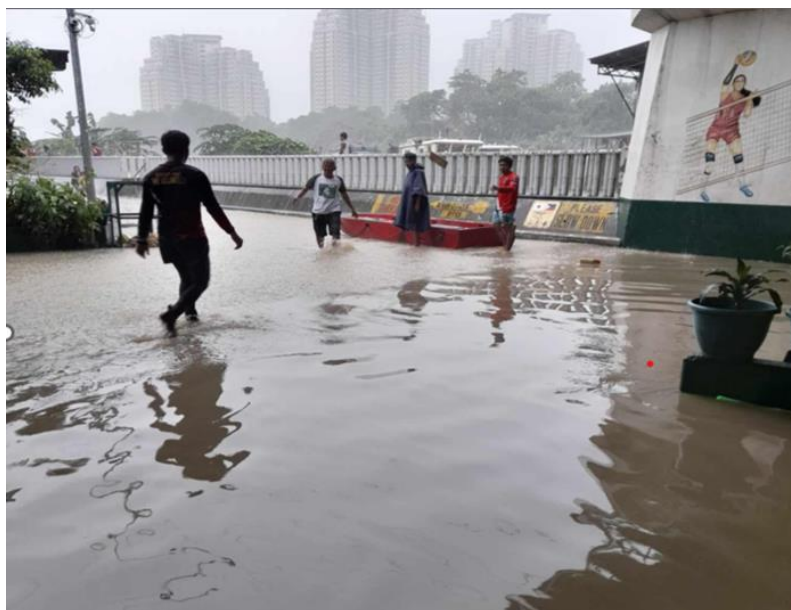
Brgy Rosario bridge, taken by Church volunteer of SSDM Sto Rosario de Pasig