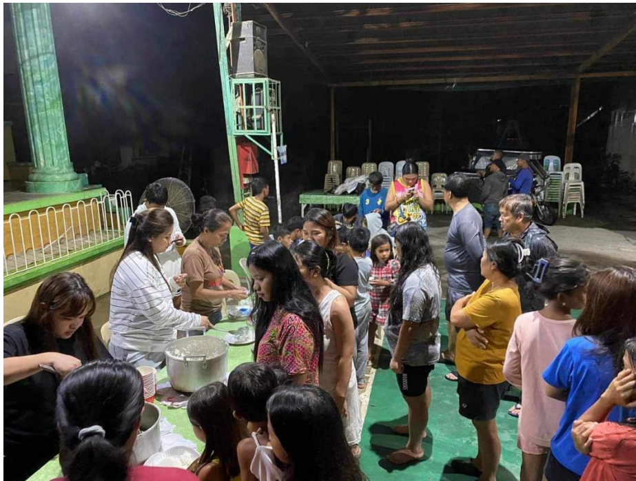
Provision of hotmeals to the families affected by the TY Carina in San Pablo, Laguna.