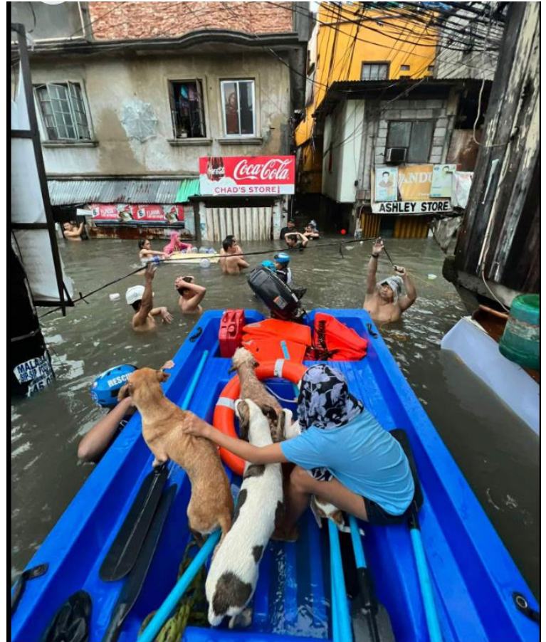
Manila Disaster Risk Reduction and Management Office (MDRRMO) emergency responders rescue stranded pets and families affected by TY Carina due to heavy flooding.