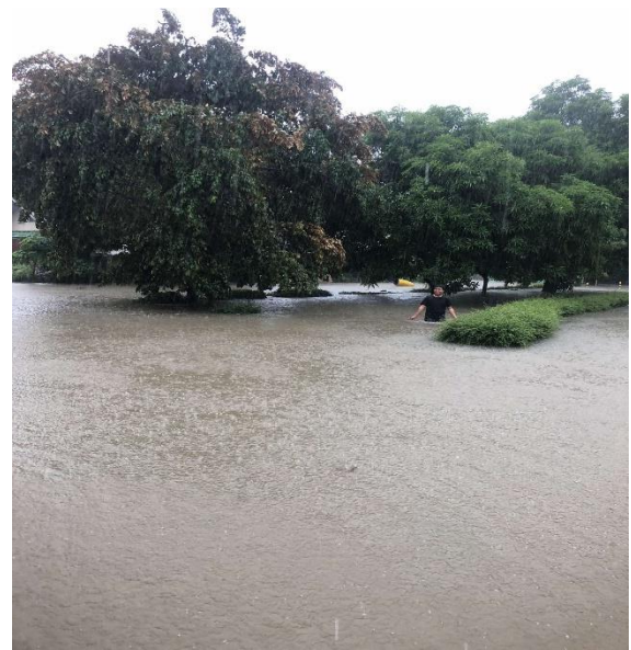
Residential Village in Cainta Rizal. Taken outside the house of one of the Caritas volunteers.