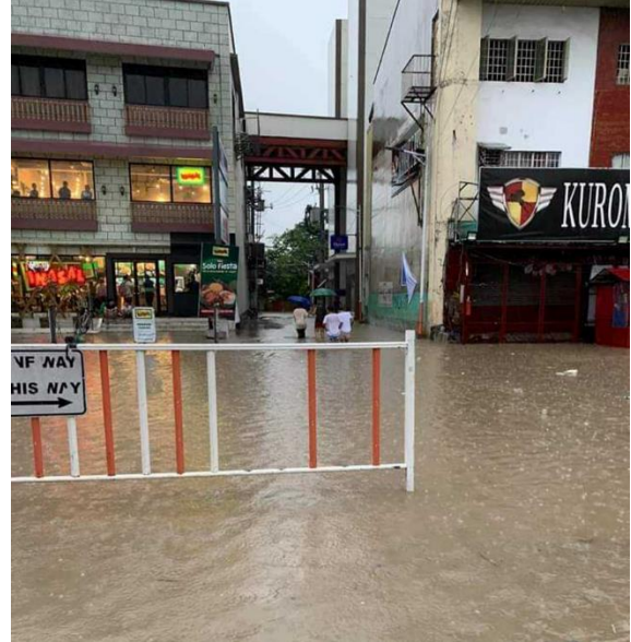
One of the main roads of Municipality Center (Poblacion) in Binan Laguna.